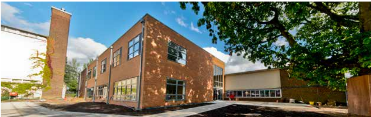
New facilities at Shaftesbury High School - Outstanding for children with Special Educational Needs'

We held our most successful Harrow's Heroes awards yet this year celebrating the vital, but unsung contribution that countless volunteers make to our communities. One of the winners from the Gurkha community even got a letter of recognition from the Prime Minister as a result of winning a Harrow's Heroes award. Community consultation is also at the heart of our regeneration activities. So this year we have established the Harrow Residents Panel, to have an on-going dialogue with the community about the borough's regeneration programme. It had its inaugural meeting in the autumn and will continue to meet on a bi-monthly basis.